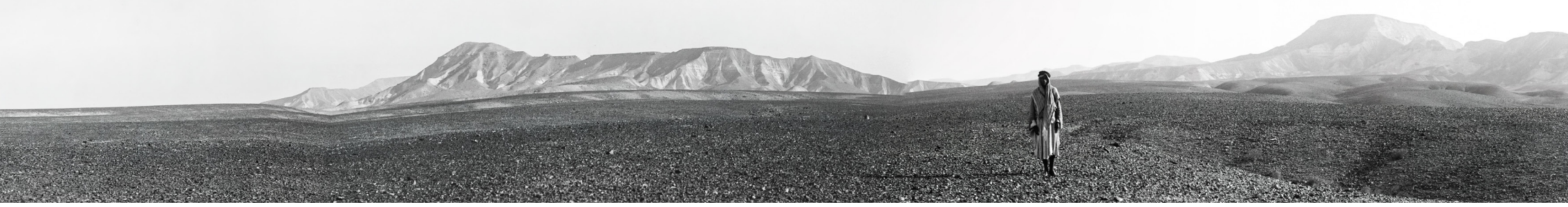
Desert and mountains of the southern border of Palestine, 1925-1927