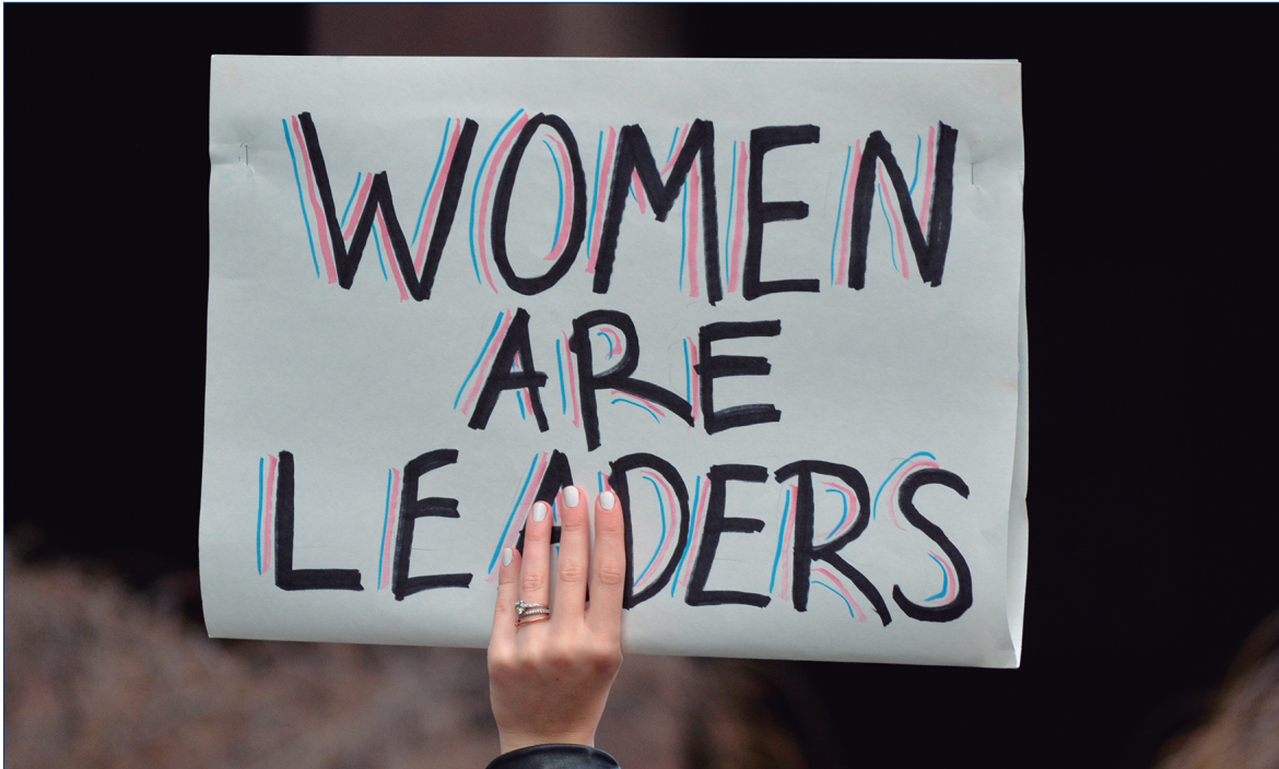
There is an urgent need to prepare women for the exercise of political power and to raise the public's awareness through media campaigns.

As for the economic situation, the poverty rate is 26.6% in Ma'an, compared to 14.4% Kingdom-wide. The number of poor people in Ma'an stands at 30,966, i.e. 3.5% of the total number of people living in poverty in the Kingdom, while the number of poor families in the Kingdom reaches 3,882, i.e. 3.3% of the total number of poor families in the Kingdom. Moreover, there are five pockets of poverty in Ma'an Governorate: Mraighah Sub-District, Iel Sub-District, Jafr Sub-District, Azra Sub-District and Ma'an Qasabah District 11 . This has repercussions on the economic, social and cultural status of women living in these areas.